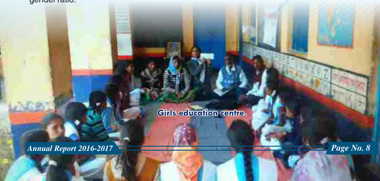
Girls education centre.

After birth girls have to pass through many types of discrimination. Girls deserve to be treated equally with boys in the matters of education, health, security, food etc., since they enjoy equal rights in every sphere of life. We can say that instead of empowering the women, they are rather being depowered. It is a well recognised fact that empowering girls and women will lead to progress all over, especially in the family as well the society. So the institution has initiated the programme of transforming negative human bias into positive attitude towards the girls. It is possible that the programme launched by the institution and similar initiatives taken by other organisations will in the course of time bear the fruits and help in eradicating discrimination against the girls in our society. Under the programme Beti Bachao Beti Padhao, Gandhi Manav Kalyan Society is making sincere efforts, particularly in the fields of girls' education, in order to stop gender discrimination and bridge the gap in the male and female gender ratio.