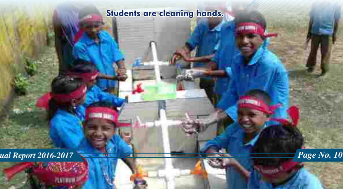
Students are cleaning hands.