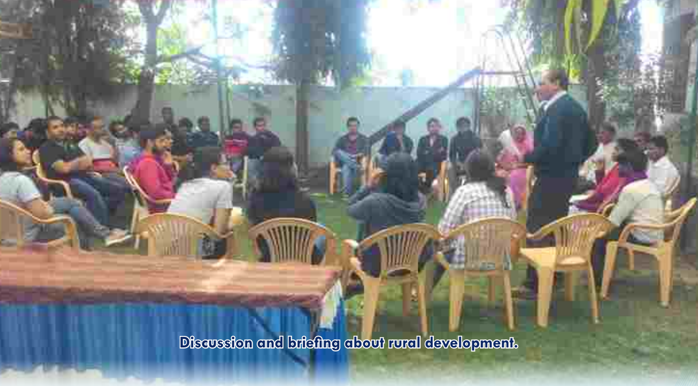
Discussion and briefing about rural development.