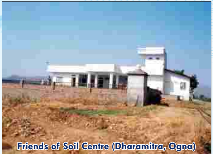
Friends of Soil Centre (Dharamitra, Ogha)

how to increase the production of cash crops? (4) Training is also imparted on water management and water budgeting together with training on milk production. Dharamitra centre is like a school for farmers. Small courses useful to the farmers are designed here in which the secrets of sustainable agriculture are also included.