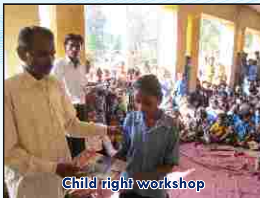
Child right workshop

The working area of the institution is known for child labour and migration. The children of the area are taken to Gujarat through agents to work in the cotton fields and this practice has taken deep roots here. Such agents have come up from the local community itself who would establish contact with the parents and families of the children and when a group of such children is ready, they are gathered and sent to Gujarat for cotton collection in the cotton farms or for doing other type of labour work there. Such migration not only affects the education of the children directly but also promotes child labour and leads to the violation of child rights. Since girl children are also a part of the process of migration, there are instances of bad behaviour and physical violence with them. In this connection, Gandhi Manav Kalyan Society has constituted village level monitoring groups by taking the Panchayats into confidence. Also programmes have been organised for public awareness. As a result of these initiatives, there is some improvement in the situation but due to poverty, unemployment and uncertainty of the livelihoods in the area, the flow of migration has not fully stopped.