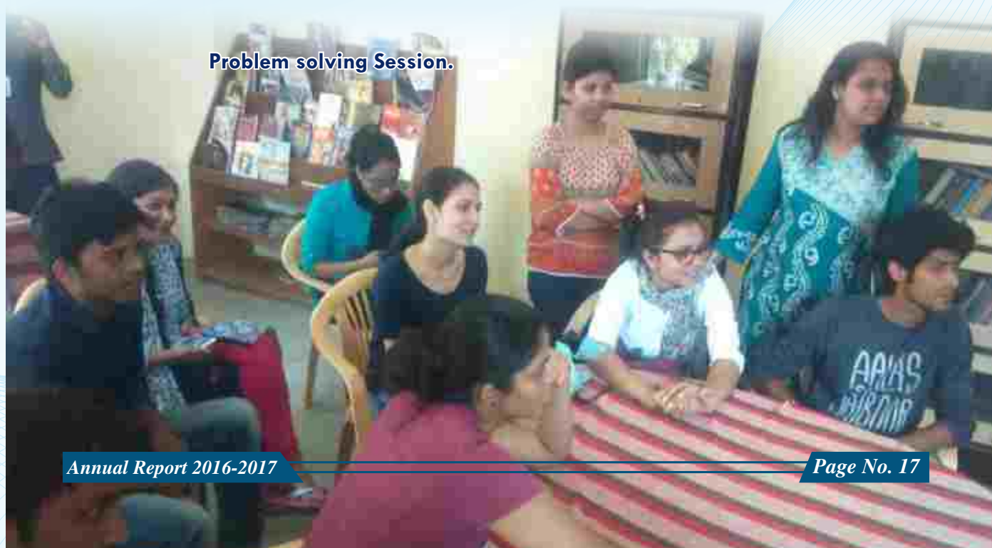
Problem solving Session.

The students also learned about various developmental programs activities being run by the institutions. These student also do research and prepare projects for the betterment of the community. This is the part of their rural orientation.